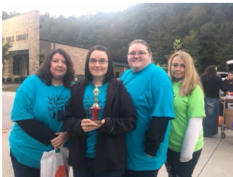
The Care Cottage won 3rd place in the decorating contest.

The Care Cottage participated in the Annual Trunk-or-Treat hosted by the Perry County Public Library on October 20th. The theme of our trunk was Monsters Inc.: Don't be scared. Various literature was included with the candy and books that touched on topics such as body safety, Trauma and Substance abuse, and not being scared to say "Boo" to drugs. The Care Cottage was able to inform about 500 children and families during this event.